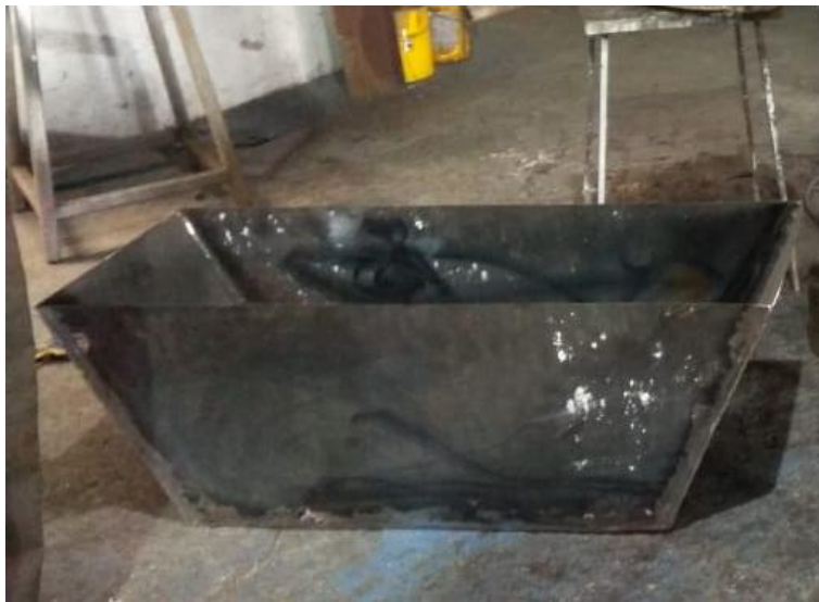
Fig 12 Tank