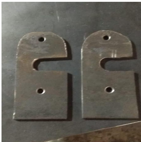
Fig 3 supporting plates