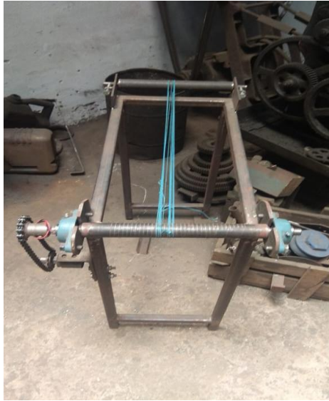
Fig 6 roller mounting and fitting

A magnetic roller is design and fabricated to attract the magnetic particles. This roller is made up of nylon rod of 32 in diameter on which we have mounted 7 permanent magnets of inner diameter 32mm outer diameter 72mm and thickness of 13mm with spacer of 34mm inner diameter 51 mm outer diameter and 25mm thickness are placed between them. A 16mm rod of 100 mm length is tightly fitted on both sides of this nylon rod so that this roller can be easily fitted on the supporting plates. This magnets and spacer arrangements are then wrapped with 24 gauge GI sheet as shown in below pictures.