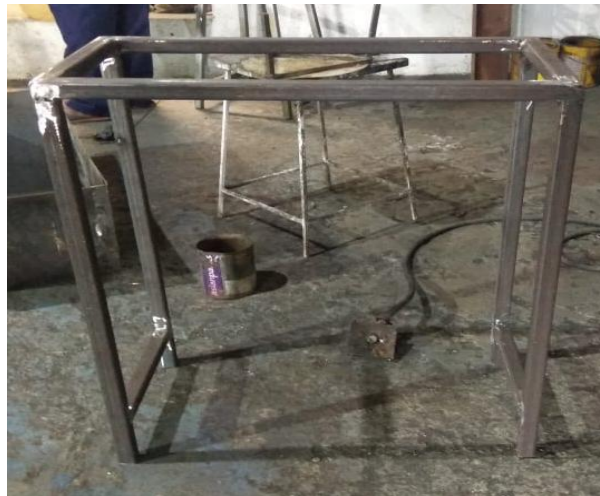
Fig 1 mild steel tube stand

Stand is made up of mild steel 25 mm tube. It's having height of 700mm and breadth of 600mm and width of 300mm. This is made to mount rollers and belt over it and also to attach magnetic roller to it. The picture of stand is shown in fig 1