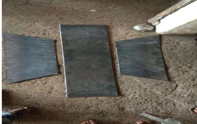
Fig11 Cut section of tank