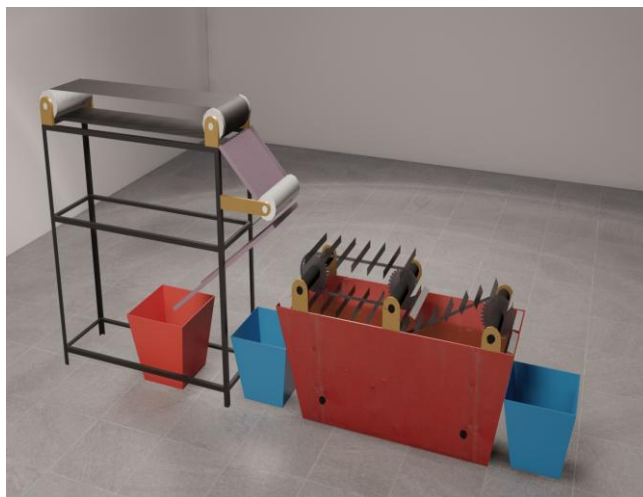
Fig13 3D model of the machine