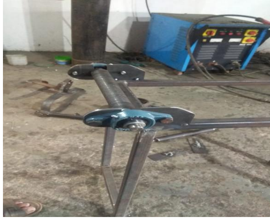
Fig 2 front roller mounting