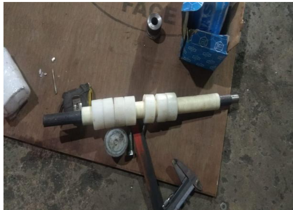
Fig 7. nylon rod

A magnetic roller is design and fabricated to attract the magnetic particles. This roller is made up of nylon rod of 32 in diameter on which we have mounted 7 permanent magnets of inner diameter 32mm outer diameter 72mm and thickness of 13mm with spacer of 34mm inner diameter 51 mm outer diameter and 25mm thickness are placed between them. A 16mm rod of 100 mm length is tightly fitted on both sides of this nylon rod so that this roller can be easily fitted on the supporting plates. This magnets and spacer arrangements are then wrapped with 24 gauge GI sheet as shown in below pictures.