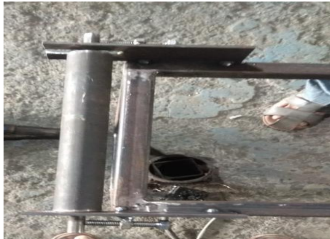
Fig 5 Rear roller mounting