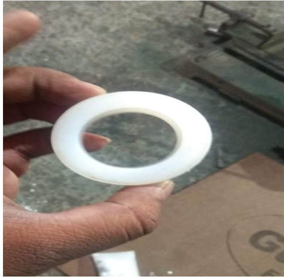
Fig 8 spacer