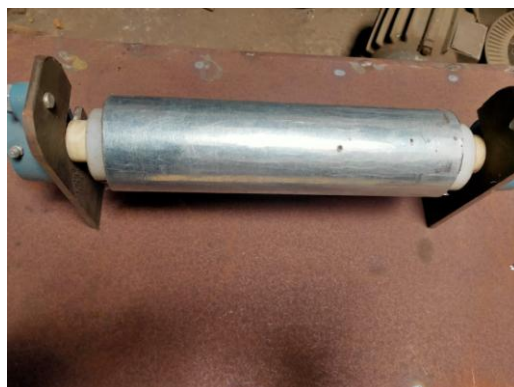
Fig 10 Magnetic roller

Tank is made up of mild steel material of 2mm thick sheet with base length 600mm, top length 900mm, height 300mm and width 300mm. This tank holds two chain sprocket arrangement with plates attached to it at both top of the tank and the base of the tank respectively to remove lighter material from the top and denser material at the base respectively. This tank is water sealed as it filled with water.