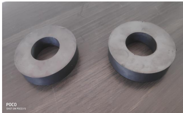
Fig 9 Permanent magnet